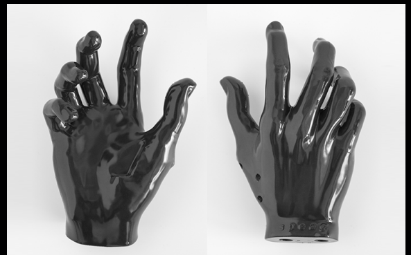
mmW- hand phantoms with CTIA-compliant handgrips for 5G and 6G applications

For further information and technical specifications, visit www.speag.swiss