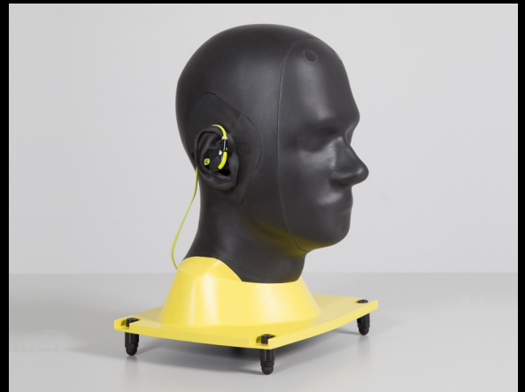
POPEYE10 head phantom in a head-set testing setup